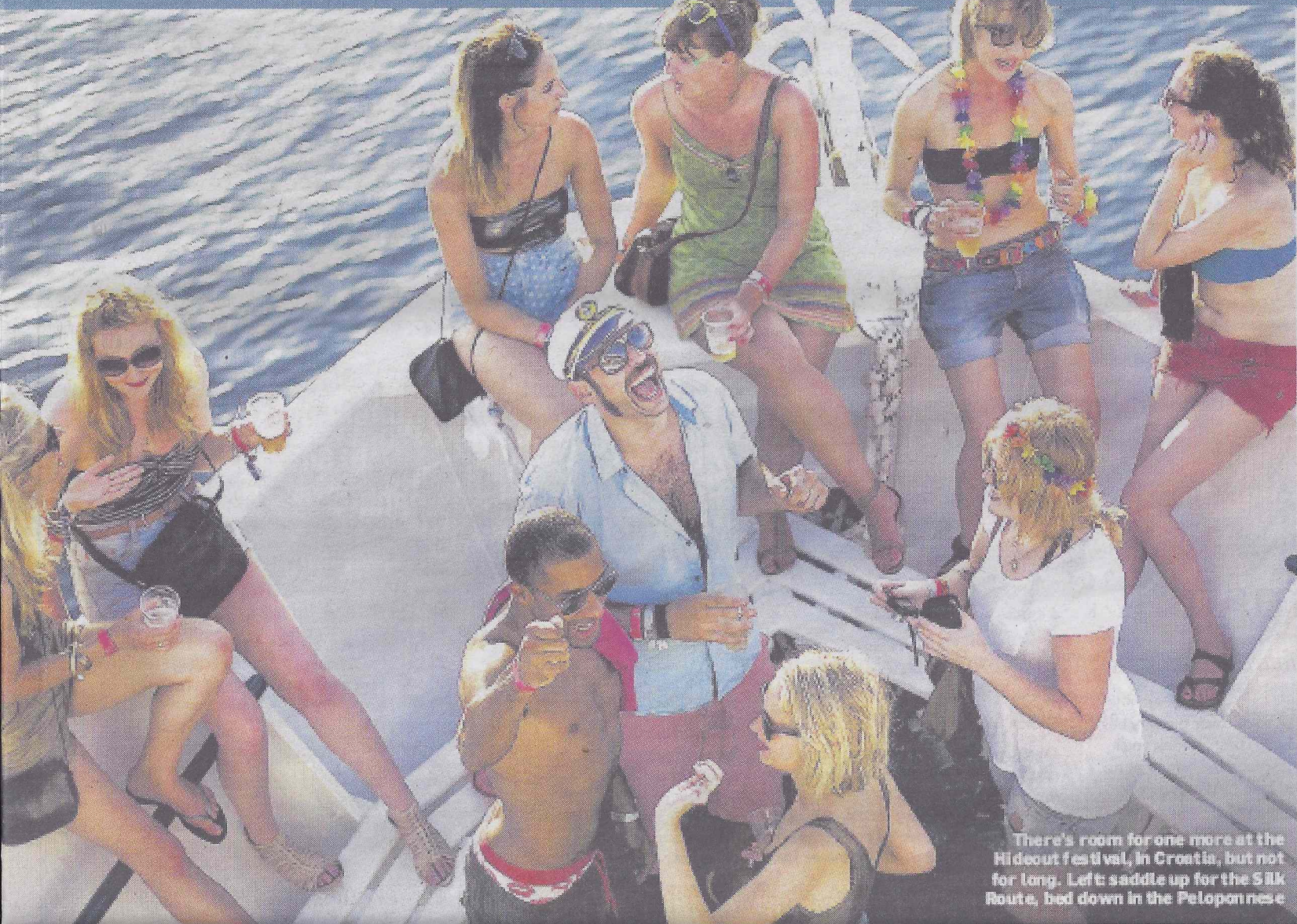
There's room for one more at the Hideout festival, in Croatia, but not for long. Left: saddle up the Peloponnese